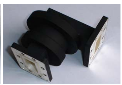
Part No: VT140WRJU